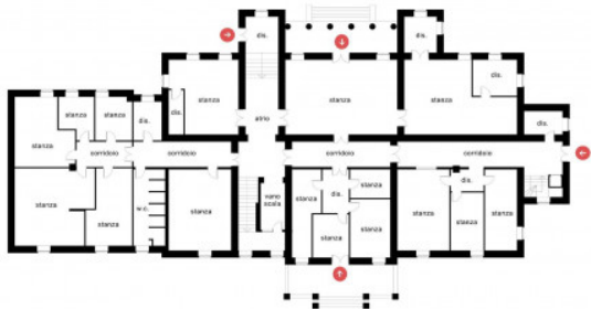
PIANO TERRA FORMATO A4 / SCALA 1:200