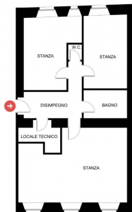
PIANO PRIMO SCALA 1:50 FORMATO A3