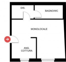
PIANO TERRA SCALA 1:50 FORMATO A3