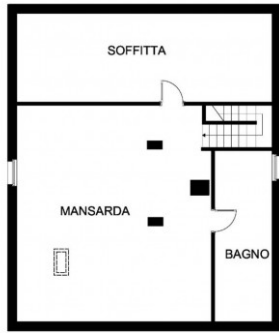
PIANO SOTTOTETTO SCALA 1:50 FORMAATO A3