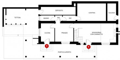
PIANO TERRA SCALA 1:100 FOMRATO A4