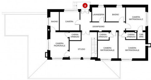
PIANO PRIMO SCALA 1:100 FOMRATO A4