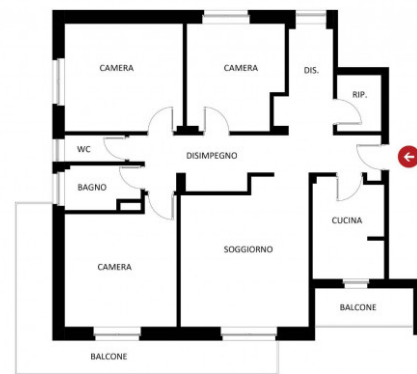
PIANO QUINTO SCALA 1:50 - FORMATO A3