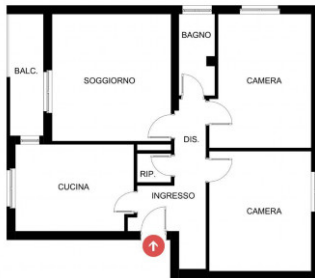
PIANO TERZO SCALA 1:50 FORMATO A3