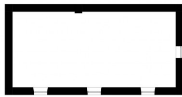
PIANO SECONDO SCALA 1:50 FORMATO A3