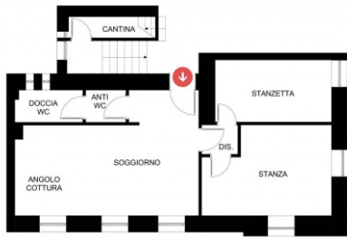
PIANO TERRA SCALA 1:100 FORMATO A3