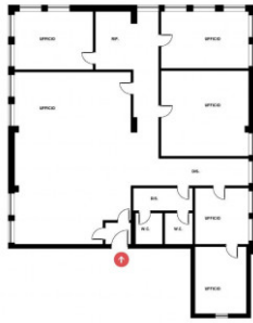
PIANO PRIMO SCALA 1:100 FORMATO A3