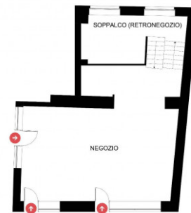
PIANO TERRA SCALA 1:50 FORMATO A2