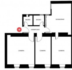
PIANO QUARTO SCALA 1:100 FORMATO A4