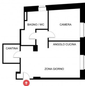
PIANO SOTTOSTRADA SCALA 1:50 FORMATO A3